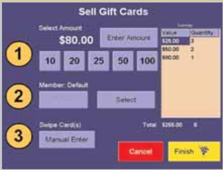
Gift Card Wizard

“We were looking for a POS system that was easy to use, explain and train our staff on. The graphic interface is conducive to this and the system makes it easy to quickly enter orders efficiently.”